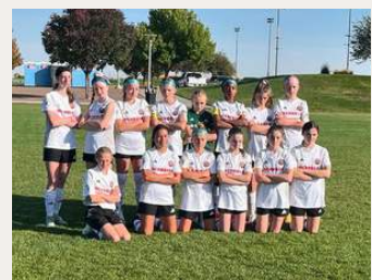
COPA 12G WIN VS LA ROCA