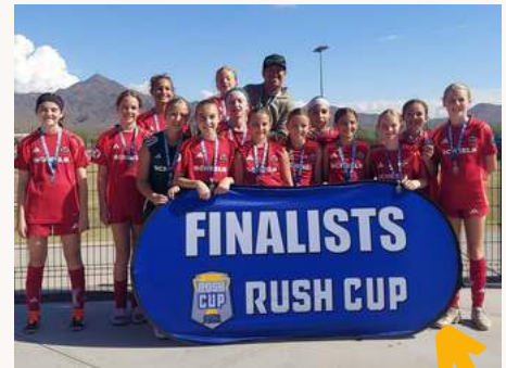
PRED 12G 2ND PLACE RUSH CUP - AZ