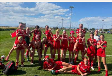
COPA 11G WIN VS LA ROCA