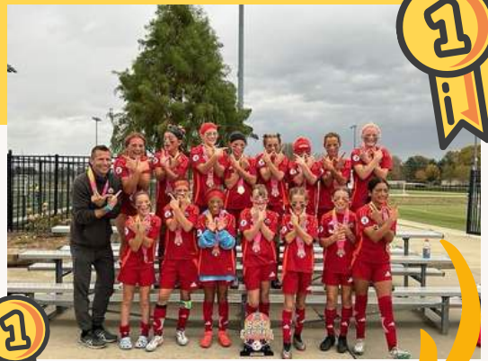
PRED 13G 1ST PLACE SLSG CLASSIC