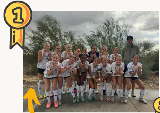
PRED 11G 2ND PLACE RUSH CUP - AZ