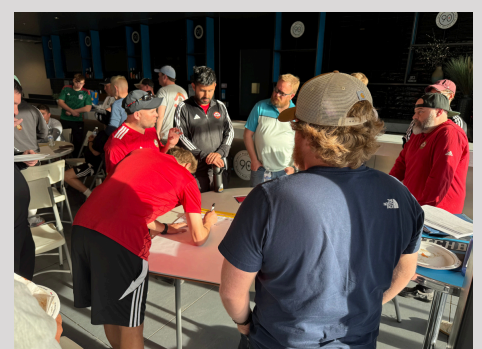
Coaches Ed - April 8 th - Phil Long Room @ Weidner Stadium

The result is The Pride Way —our shared identity and coaching philosophy designed to strengthen community, deepen belonging, and better support our coaches and players.