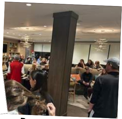
Predators G10/09/08 ECNL-RL KC Showcase