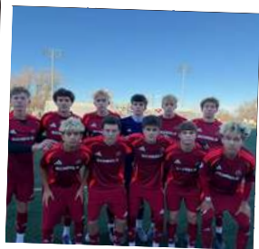
Predators B11 ECNL League Games