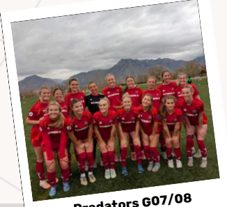
Predators G07/08 ECNL-RL Utah League