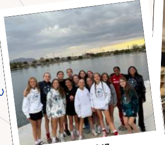
Copa G13 JPL Tournament