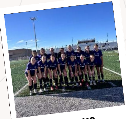
Predator 11G ECNL-RL Utah League