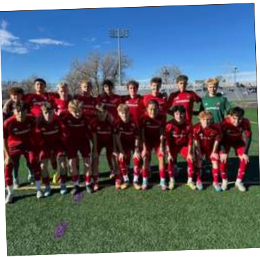
Predator 09B ECNL Utah League Games