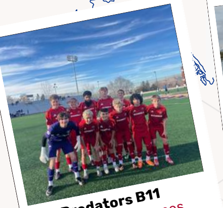
Predators B11 ECNL League Games