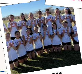
Red G11 Rangers Showcase