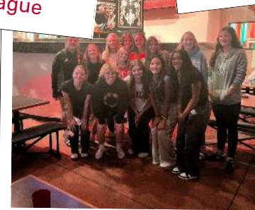
Copa G11 JPL Tournament