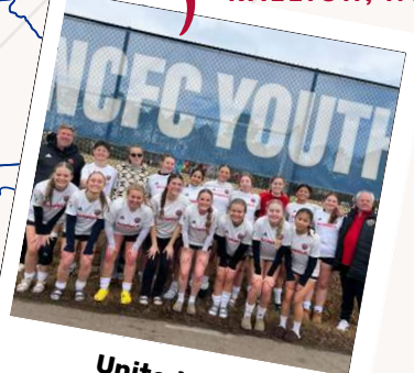
United 08G NCFC Showcase