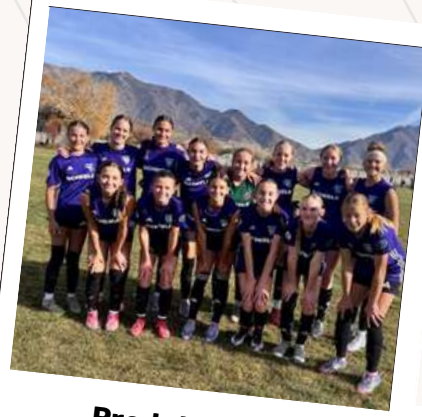
Predator 12G ECNL-RL Utah League