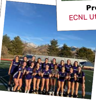
Predator G11 ECNL-RL Utah League